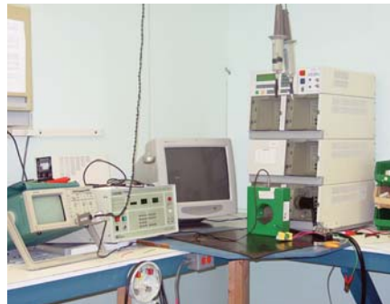
ECAT Surge Generator