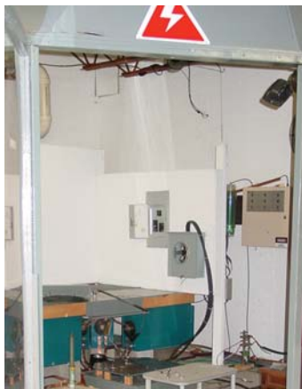
High Energy Test Lab