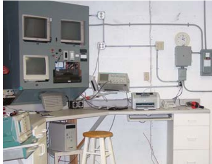
Lab Control Console