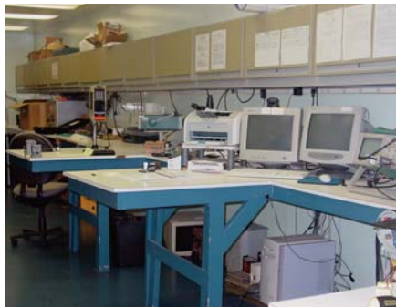
ECAT Control & Data Acquisition Center