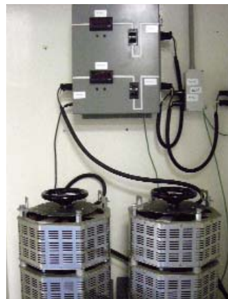
Lab Power Distribution Center