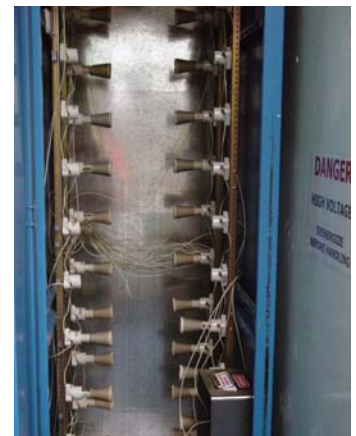
Abnormal/Limited Current Testing Equipment