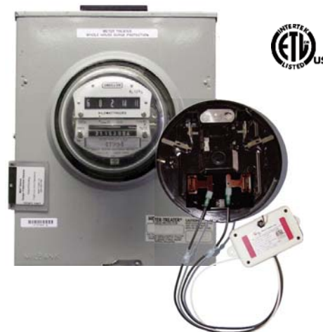
Listed for 200 and 400 AMP Continuous Service Three Phase Devices also available.

A 15 Year Product Warranty and concurrent Consequential Warranty are included. Additional warranty terms are available.