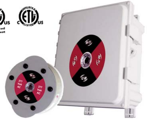
NEMA 4X Polycarbonate Housing Shown